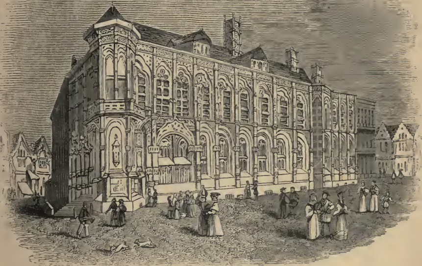
GHENT.—The Old Maison de Ville. From an Original Drawing.

Item,—we are willing that all prisoners of their party, supposing them to have agreed for their ransom, shall have their liberty, on paying the stipulated sum and other reasonable expenses; provided, however, that if any of the said prisoners, their relations or friends, hold any fortresses against us, such be first given up: and on like terms shall those attached to us, and confined by our subjects of Ghent or their allies, be set at liberty.